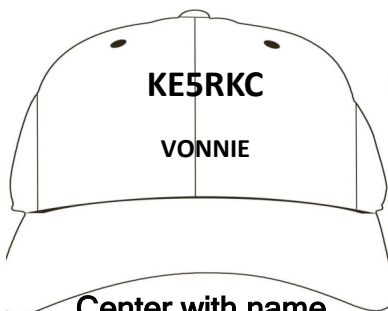
Center with name